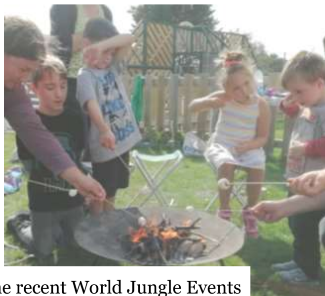
Children enjoying the recent World Jungle Events held at the Hazel View Community pitch